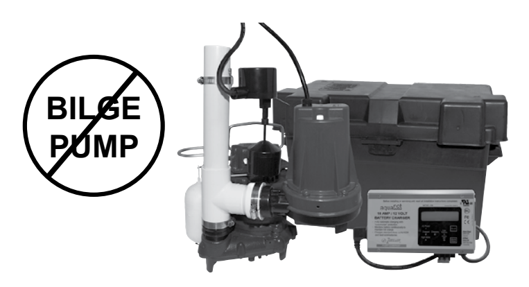
Primary pump not included. Product may not be exactly as shown. For preassembled systems, order a ProPak.

An integrated DC pump discharge check valve, additional AC pump check valve, tee, and adapter are included.