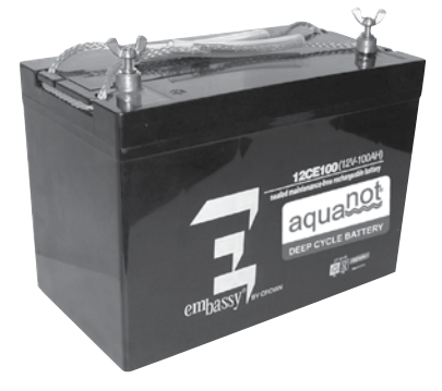
\begin{array}{c} Aquanot^{\circledR} \ \ Deep-cycle \ \ Battery \ (purchase \ separately) \\ P/N \ 10-1450 \ - \ AGM \ (shown) \\ P/N \ 10-0761 \ - \ Wet \end{array}

WARRANTY - 3 years from date of purchase.