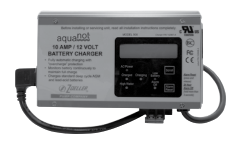
Model 508 Controller